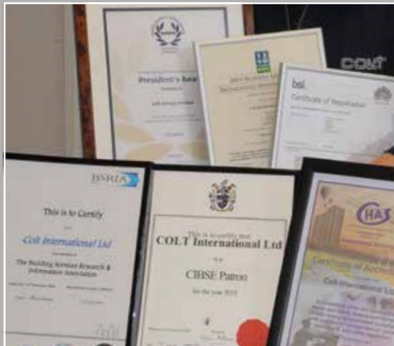
We are widely recognised by both industry and regulatory bodies as one of the most qualified smoke control authorities.