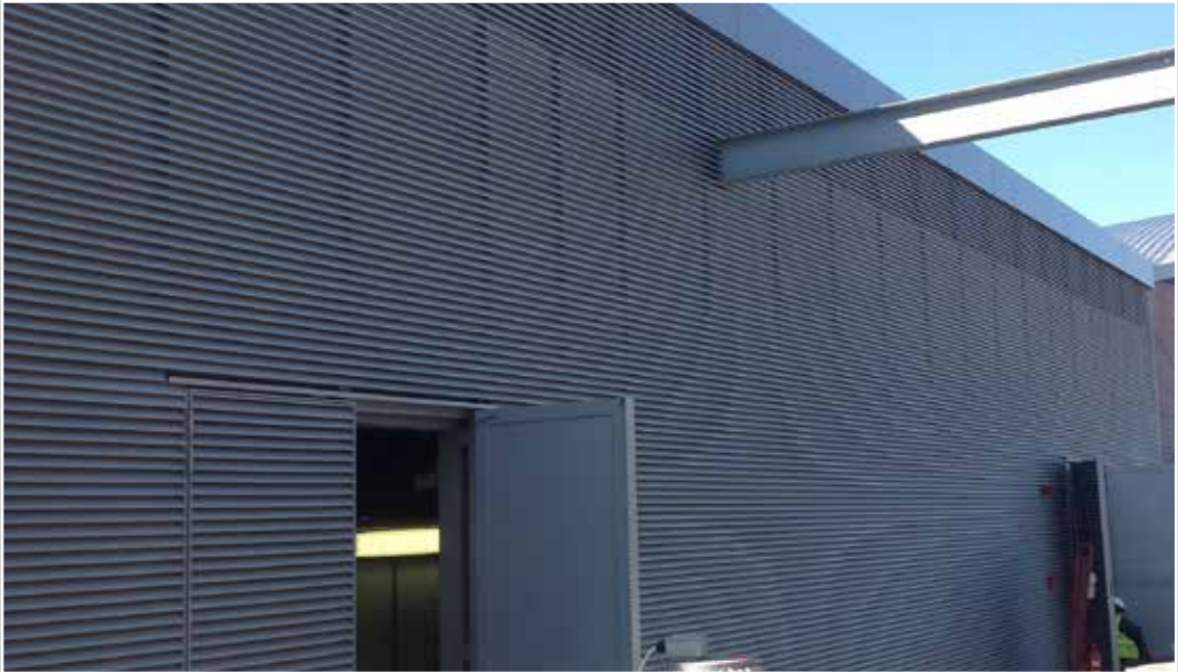
Shading & Louvre