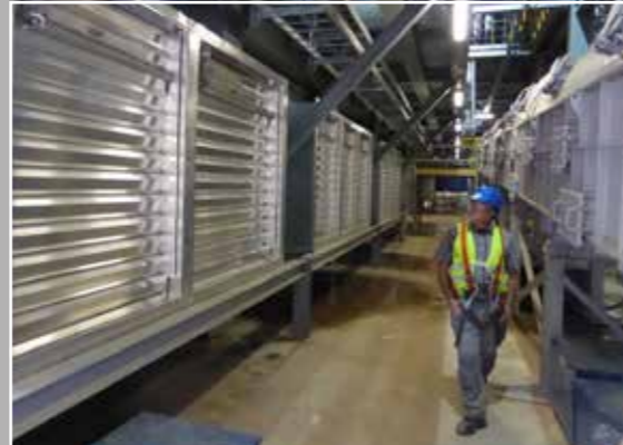
Whether built by us or others, all smoke and climate control systems can be expertly maintained by our engineers.