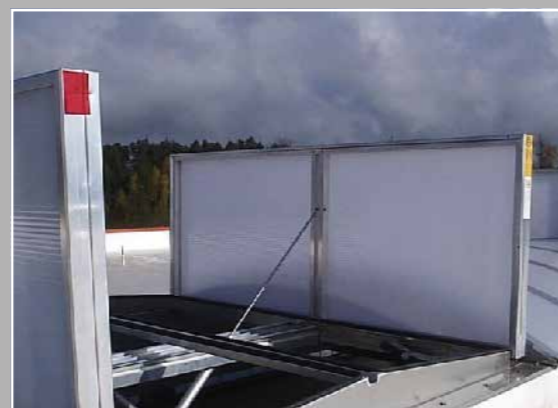
Natural flap ventilators provide smoke and ventilation for most kinds of industrial buildings. We service these, too.