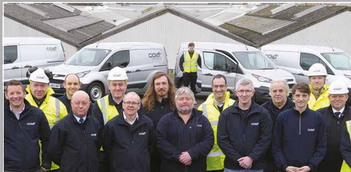
We have more fully qualified engineers stationed in more locations up and down the country than anyone else.