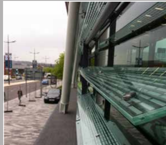
If you have a louvre shading system, such as this one at Stoke Bus Station, Colt can service it.