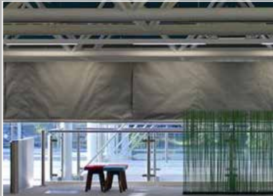
Colt designs, produces and installs smoke and fire curtains. And, of course, we also service and maintain them.