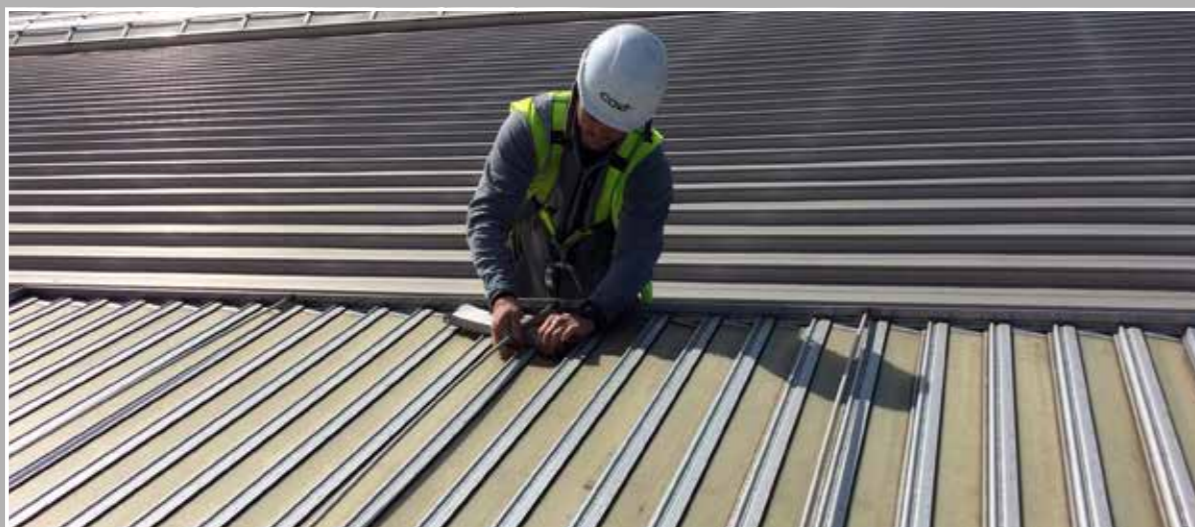
We tailor our service packages to minimise costs while keeping your building safe and in good working order.