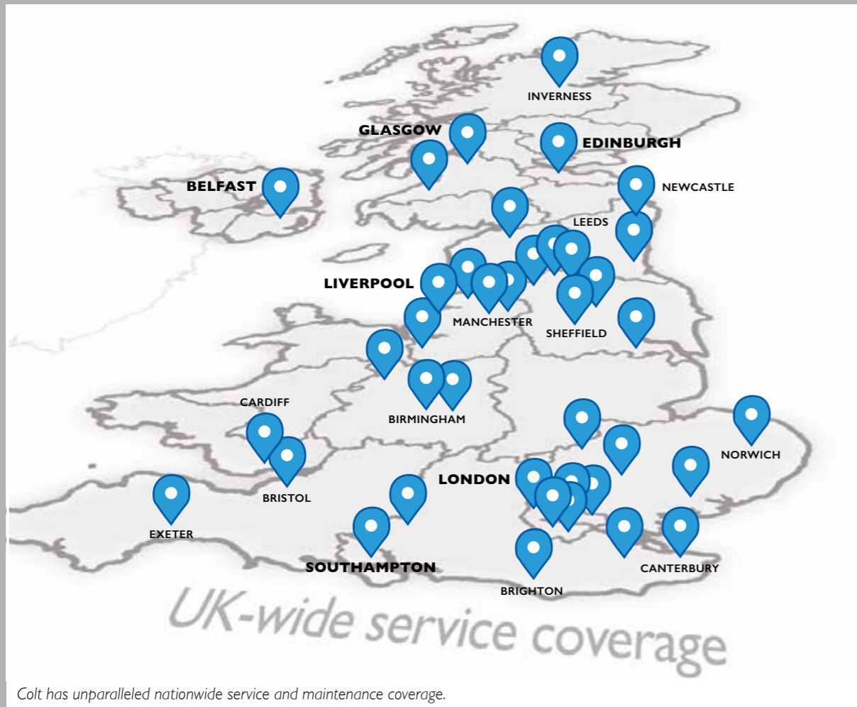
Colt has unparalleled nationwide service and maintenance coverage.