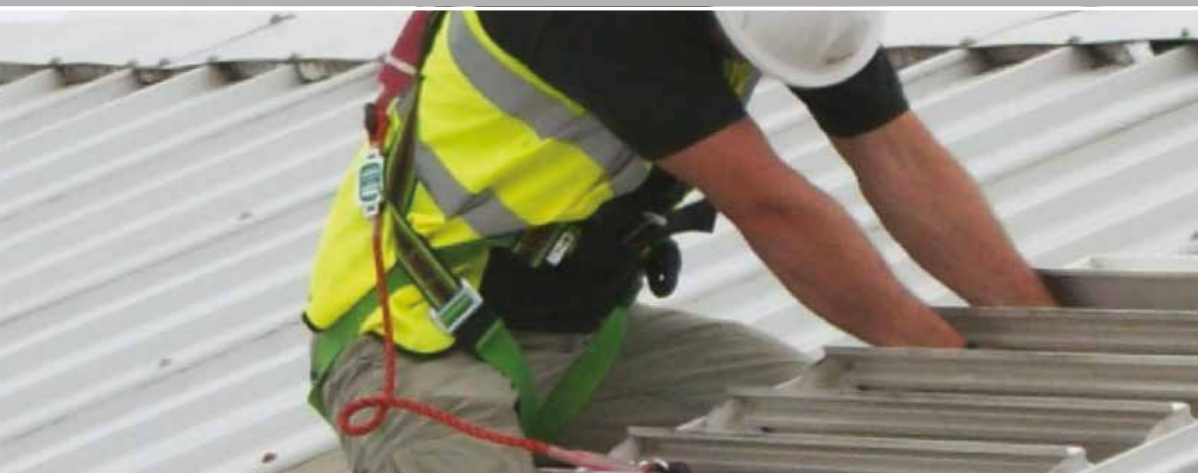
Our engineers will be with you within 24 hours. In an emergency, our average response time is 4 hours.