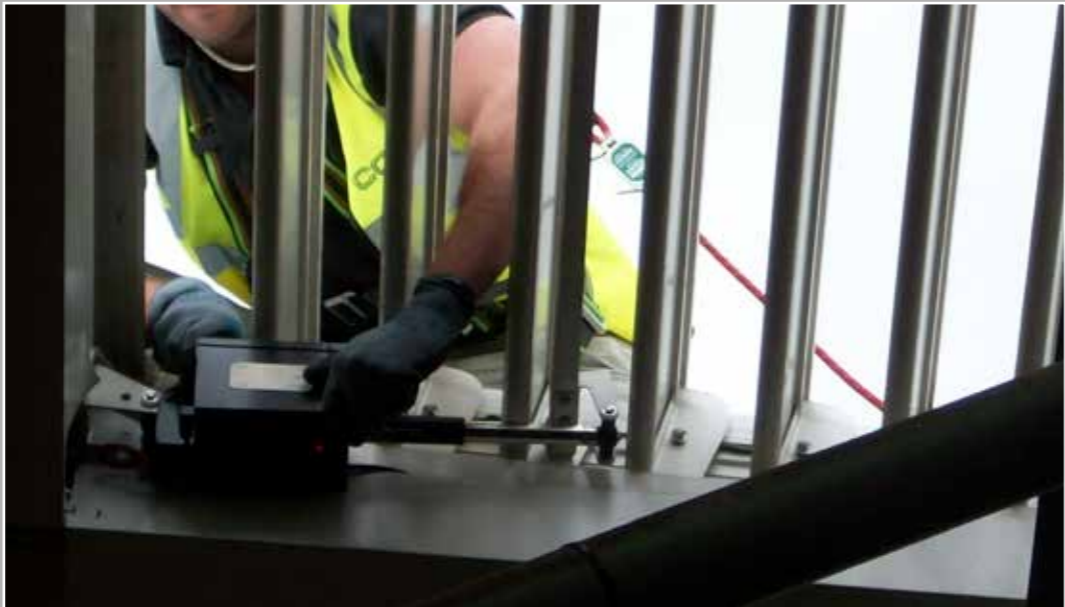
Service & Maintenance