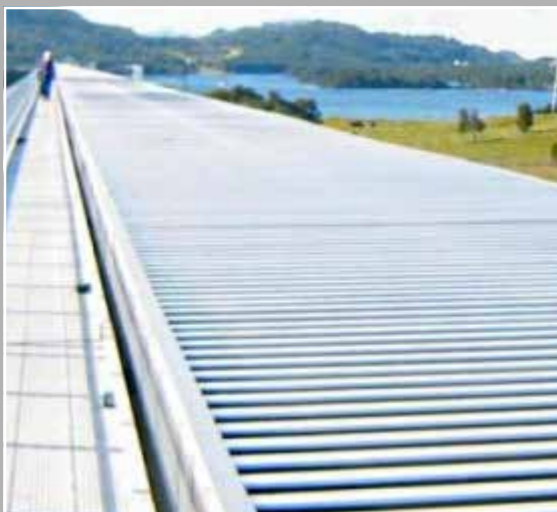
Colt were the first to recognise the importance of regular service and maintenance checks for climate control systems.