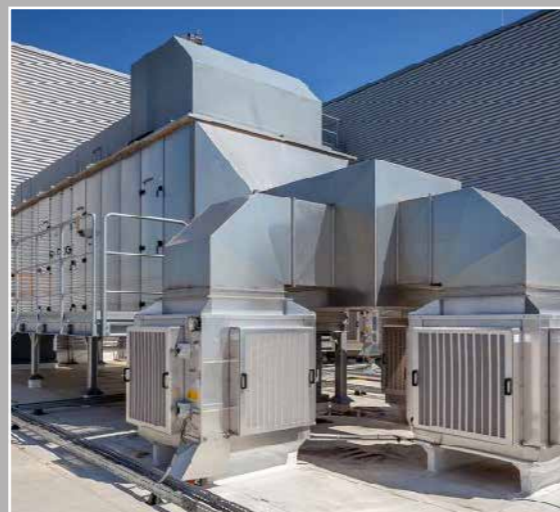
We service evaporative cooling systems of all types, such as the CoolStream STAR range.