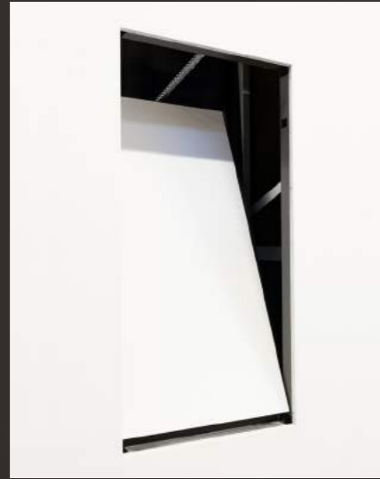
Effective ventilation when open.