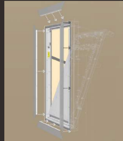
A bead edge profile is fixed to align with the opening edge to allow a plaster finish to be skimmed up to the opening.