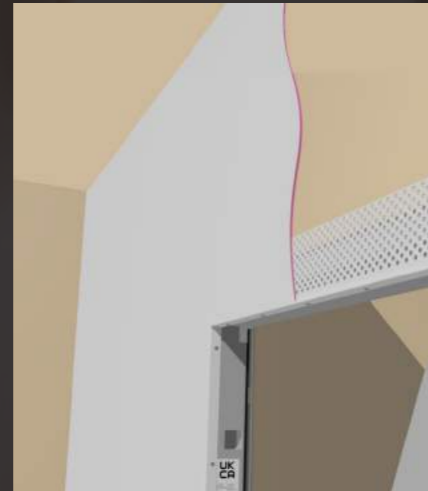
Plaster and site paint finish in any standard interior wall paint or emulsion.