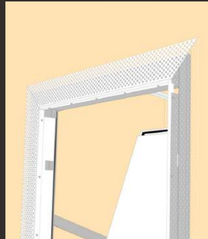
Skimmed finish and damper panel can then both be painted to match.