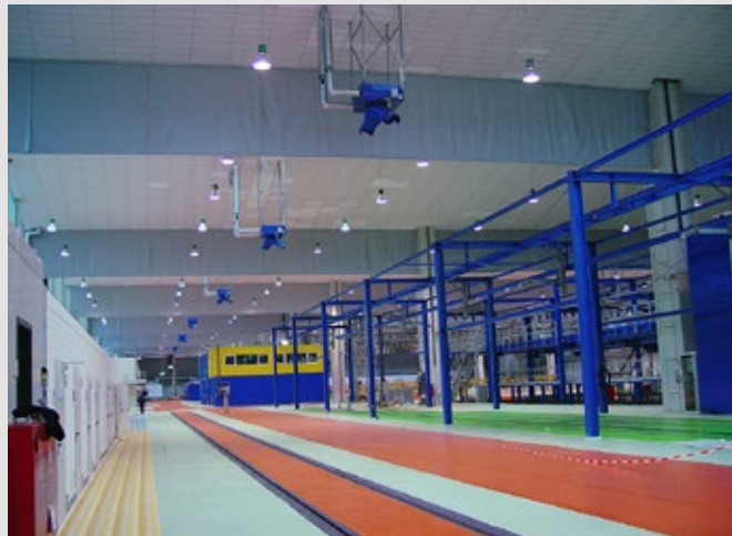
The system can be easily and quickly attached to the existing building structure