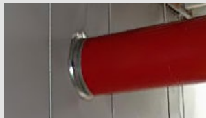
Since metal sleeves are prefabricated, penetrations of various sizes and formats can be easily produced.