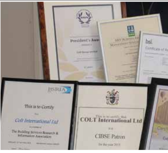
Full accreditation to put your mind at ease