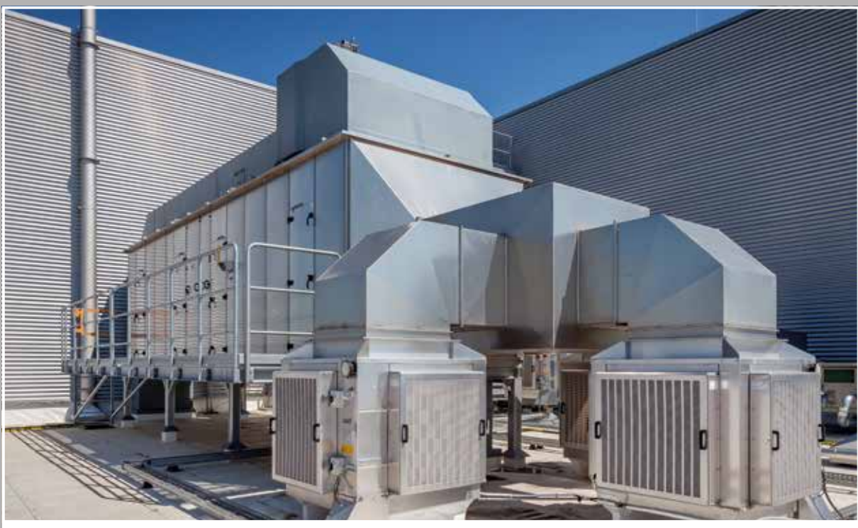
Colt CoolStream V evaporative cooling includes stress-free project management and offers low cost service and maintenance