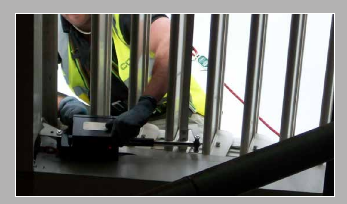
Service & Maintenance