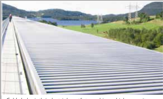
Colt's Labyrinth industrial ventilator achieves high capacity, weatherproof ventilation using aerodynamically shaped louvres.

This ad first appeared nearly 50 years ago, but yet the message remains true. People still work better in Colt conditions.