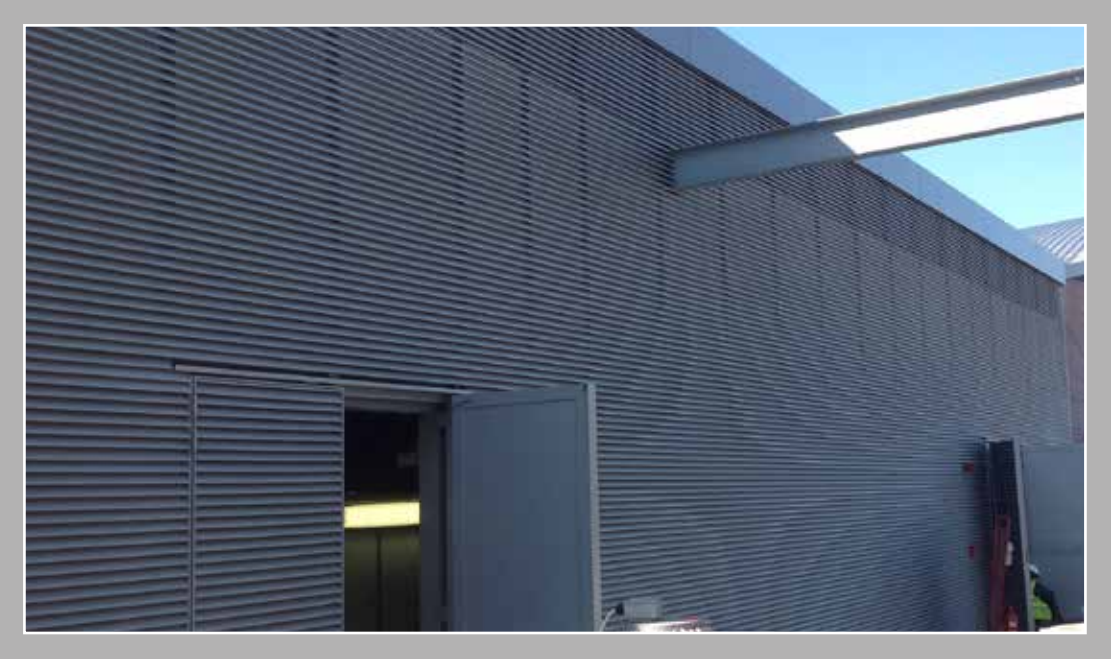
Shading & Louvre